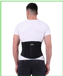
LS Belt Code - LS05 M.R.P - 1000