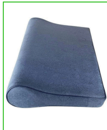
Cervical Pillow Code - CP011 M.R.P - 1000