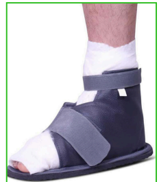
Cast Shoe Code - CS012 M.R.P - 600