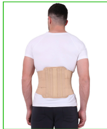
Contoured LS Belt Code - LC07 M.R.P - 1000