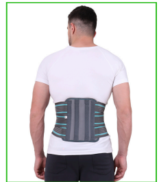
Contoured LS Belt Code - LC08 M.R.P - 1000