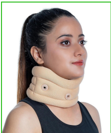
Cervical Collar Code - CC09 M.R.P - 500