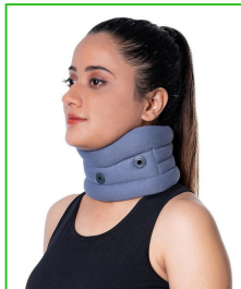
Cervical Collar Code - CC10 M.R.P - 500