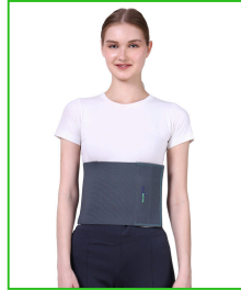
Abdominal Belt Code - AB03 M.R.P - 600