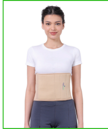
Abdominal Belt Code - AB02 M.R.P - 600