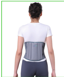
LS Belt Code - LS06 M.R.P - 1000