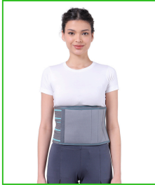
Abdominal Belt Code - AB01 M.R.P - 600