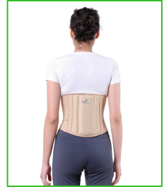
LS Belt Code - LS04 M.R.P - 1000